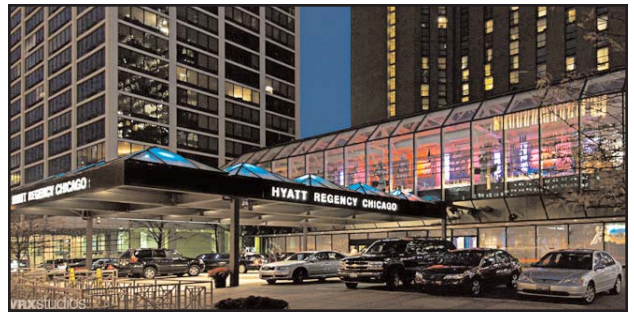
Hyatt Regency Chicago